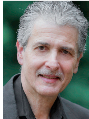
JIM LaSALA Street Photography & Better Black & White

Plan Now!! $100 deposit holds your reservation!